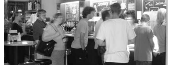
A long line formed for ice cream after the band concert in the town square